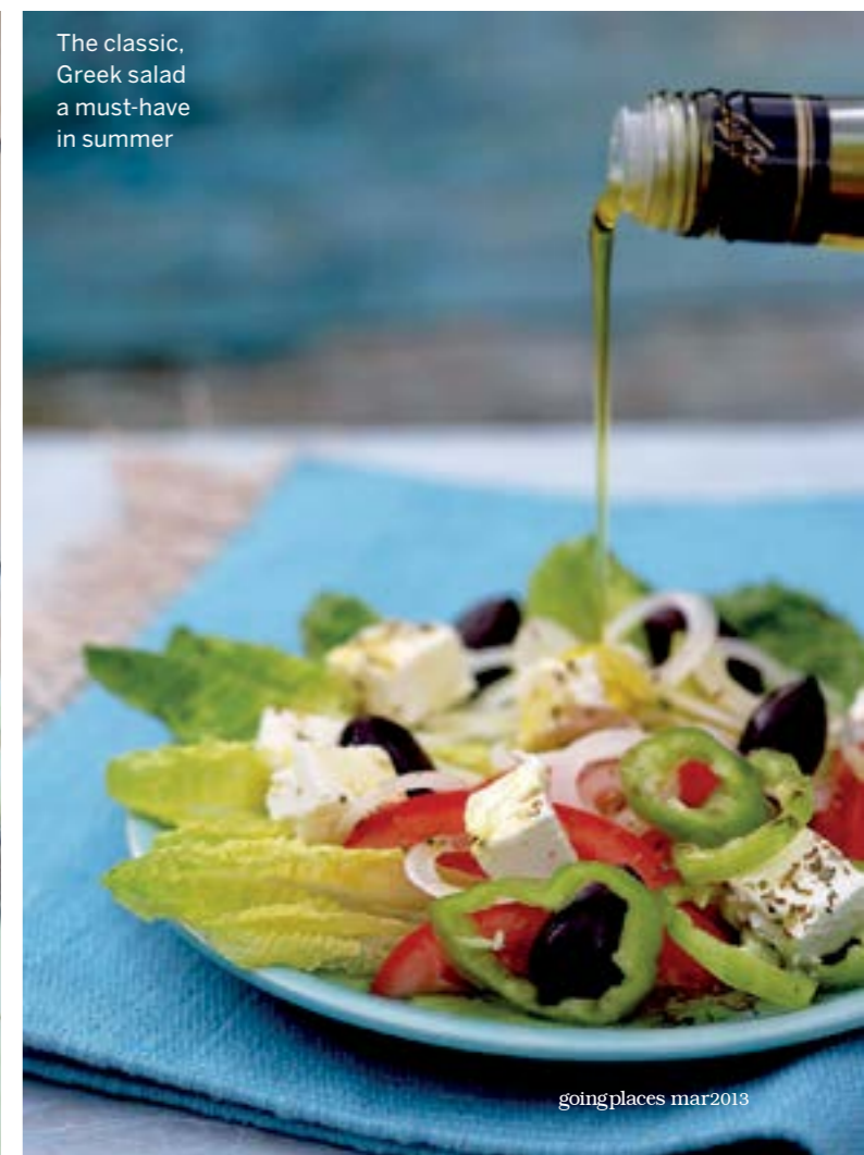
The classic, Greek salad a must-have in summer