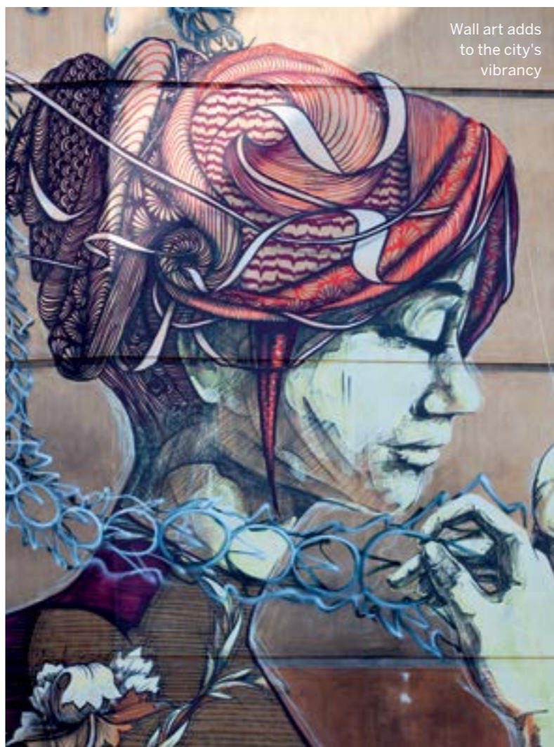
Wall art adds to the city's vibrancy